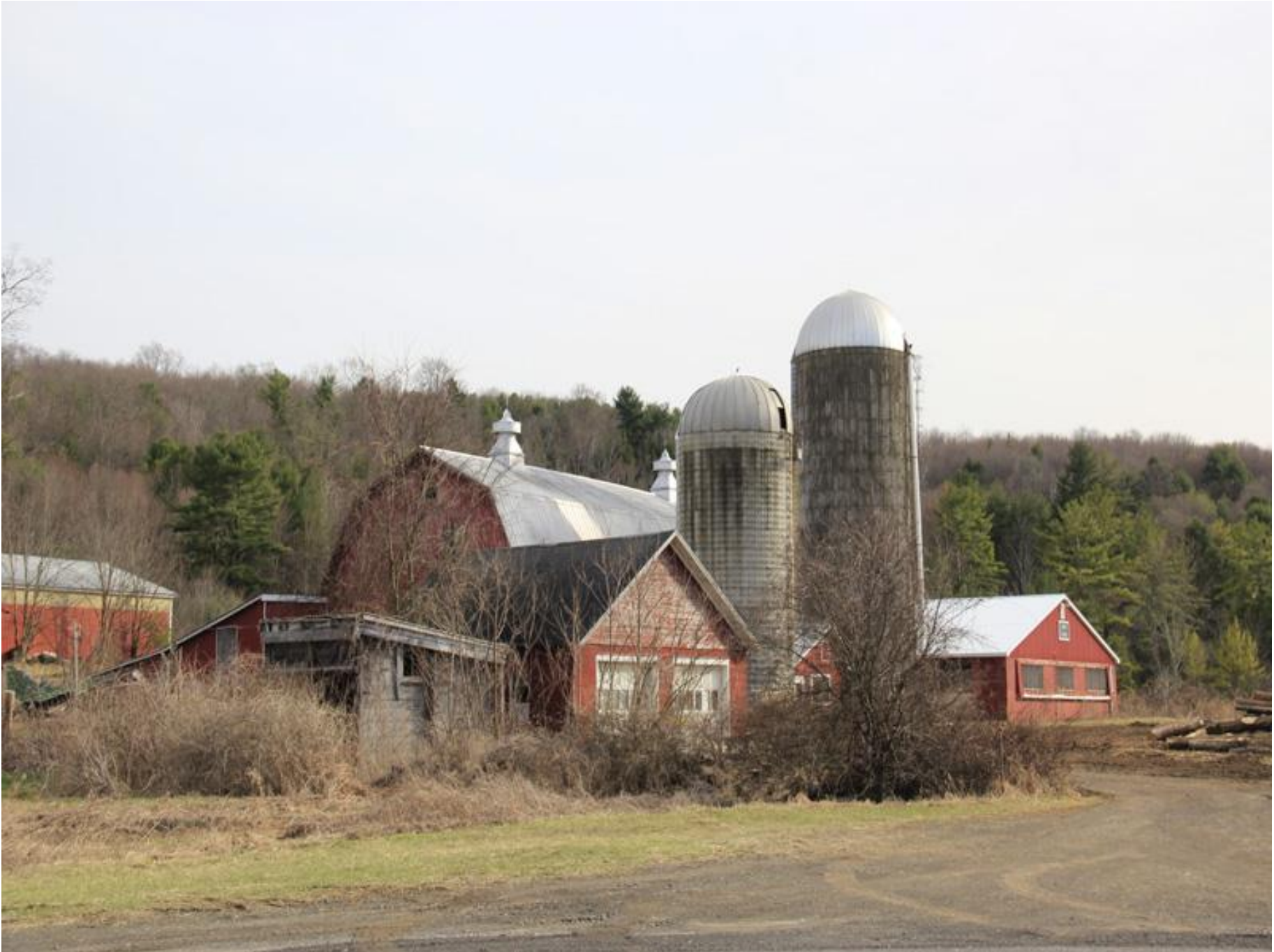
Reference Photo 1