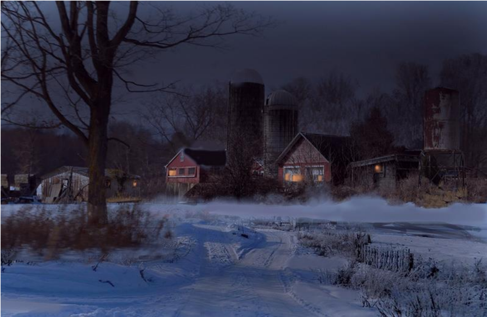
Compiled version from the three photos

Because of the printer margins, you will have to trim off a thin portion at all four sides of each page. If you are doing a watercolor, do not use transfer paper. It is impossible to erase the drawing. Instead, spread dark gray pastel on back of the 4 sections and use that as carbon paper.