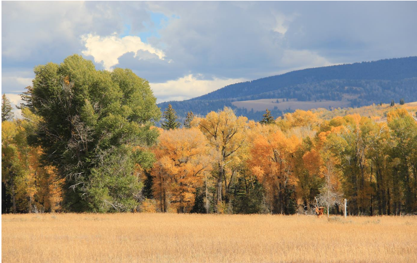
Ref Photo 1

If you print it, change the setting to "poster" under Page Sizing and Handling in The PDF program after clicking on "Print". It will print the image out exactly in proportion using 4 sheets of paper. To transfer the image onto your canvas or paper, you can place transfer paper under the printer drawing once you have taped the 4 sections together. Because of the printer margin, you may have to trim off a thin portion at all four sides of each section. Some printers allow you to change the border setting to zero. If you are doing a watercolor, do not use transfer paper. It is impossible to erase the drawing. Instead, spread dark gray pastel on back of the 4 sections and use that as carbon paper.